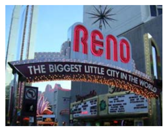
ANS 2008 Winter Meeting and Nuclear Technology Expo, November 9-13 Reno, Nevada